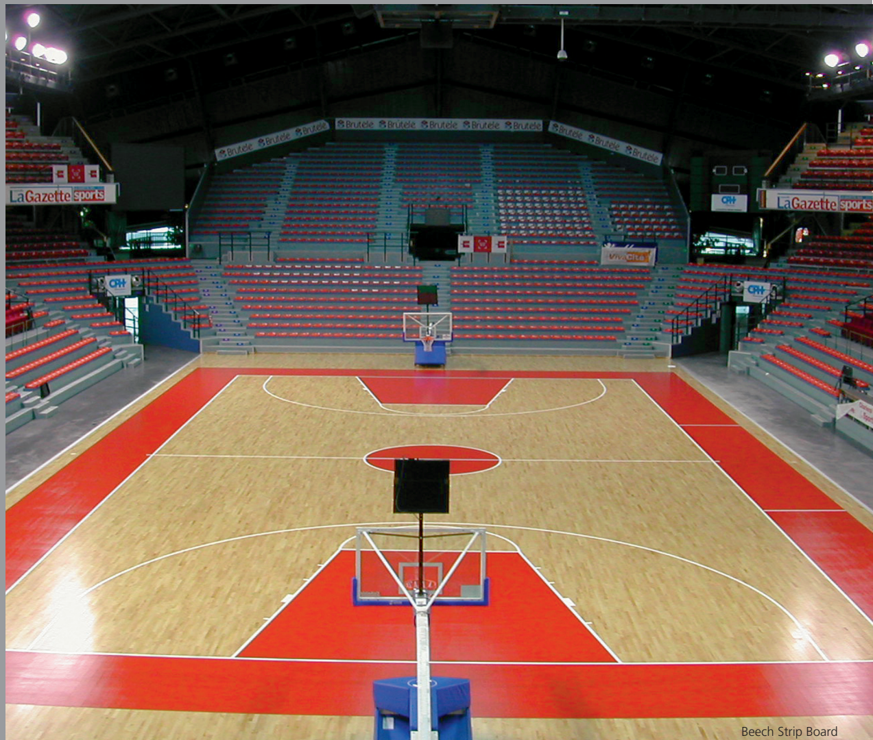
Beech Strip Board

Junckers solid hardwood flooring is produced and categorised according to Junckers factory standards and in accordance with prEN 13629. Junckers 22mm SylvaSport Beech flooring conforms to EN14904 when installed over one of our sports undercarriage systems. Junckers floors are made exclusively from solid hardwood, with all the characteristics typical of this natural material. Each style will display a unique range of grain and colour characteristics. The photographs are designed to show the average appearance of the style and species. It is normal to see a variance in appearance between individual boards and packs. Floors laid at differing times may vary slightly because of this average grading. In general, standing or lying annual rings, hairline splits and sapwood are allowed; Up to 5% of the boards may contain features of the next style option. Hardwood floors may fade and change colour over time due to exposure to natural sunlight.